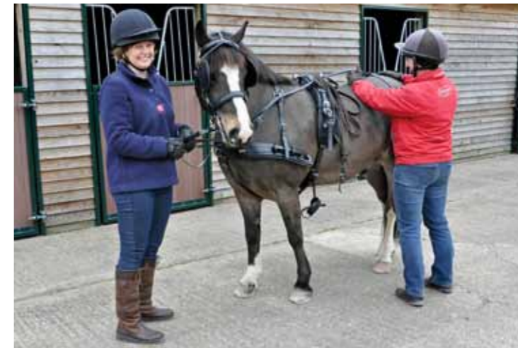
Bennington can offer advice on any aspect of carriage driving

receive in straight lengths. None of the components are bought in, other than highly specialised items, such as braking systems and tyres.