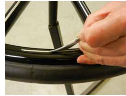
The wheels are coach lined by hand

Finally, all the wooden components are made and once they are finished, the final parts are assembled, such as braking systems, tyres, upholstery and trim fittings.