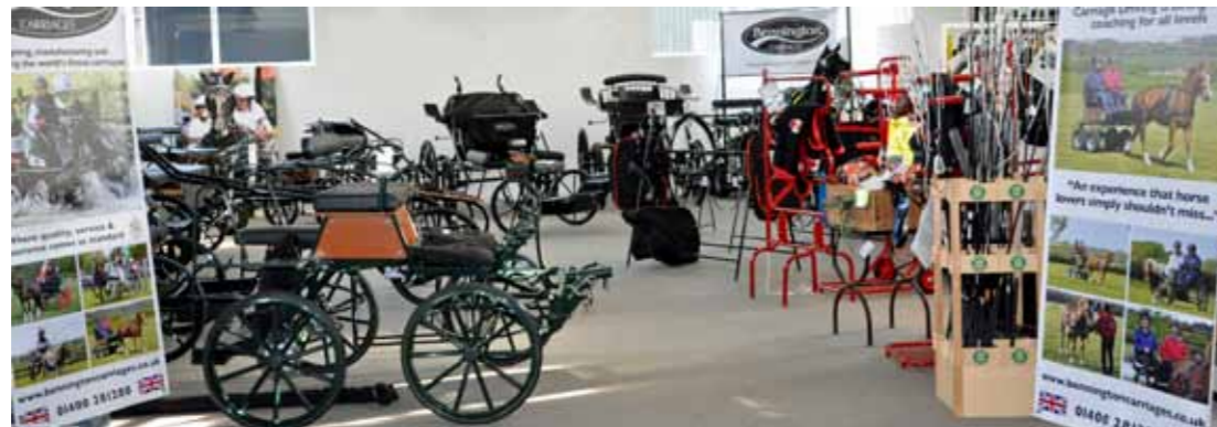
The showroom has a range of new and second hand carriages, as well as many other driving related products for sale

Everything is done in house, with each carriage being individually handcrafted to bespoke specifications.