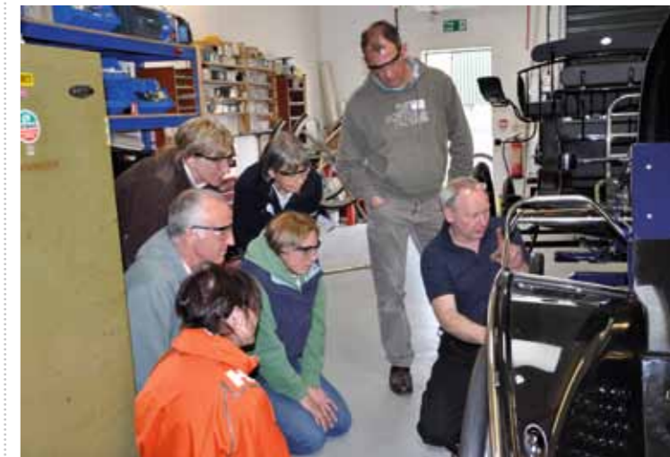
Visitors can enjoy a factory tour

For more information about Bennington and what the company offers, tel: 01400 281280 or visit: www.benningtoncarriages.co.uk .